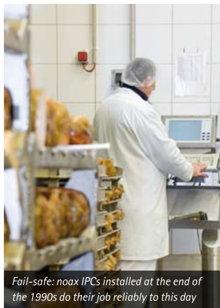
Fail-safe: noax IPCs installed at the end of the 1990s do their job reliably to this day

At that time, the Nölke Group was one of the first noax customers in the meat processing industry – whereas nowadays, it's almost impossible to think of this industry without computers by the Ebersberg-based company. One reason for this triumphant success is the high reliability of noax products: Today, even many of the first noax terminals are still being used every day in Versmold.