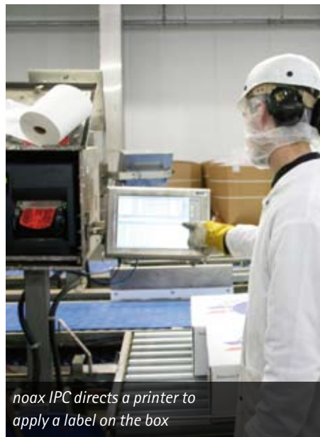
noax IPC directs a printer to apply a label on the box

compile and process the massive detail that verifies their processes. Should a safety breakdown in their processing and handling system occur, Olymel can determine where it happened, why it happened and what to do to fix the problem; including withdrawing affected products before putting consumers' health at risk.