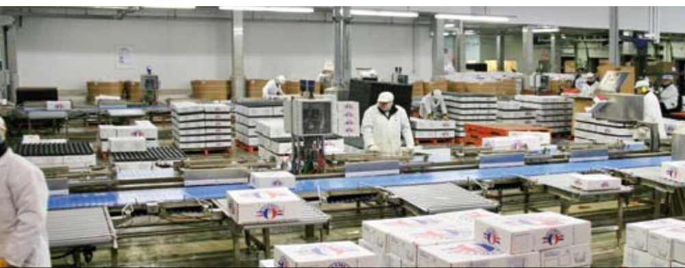
8 noax units at the weigh stations record the package weight

"Since we started using noax computers, we have seen our computer downtime drop by 80%".