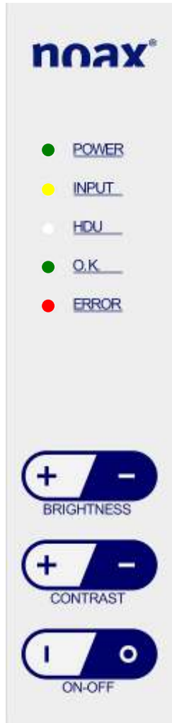
Fig. 2 Display- and operating elements S12